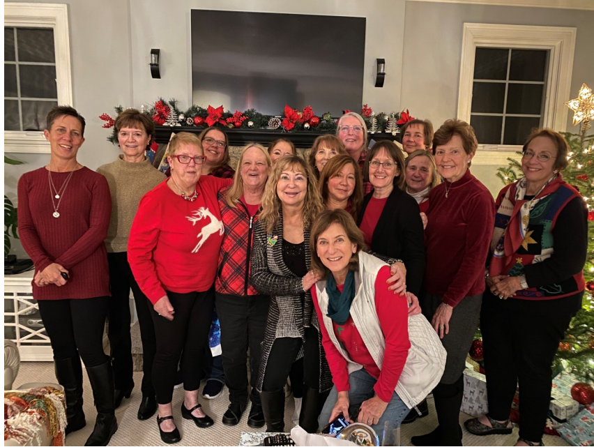
The Holly Club Christmas Party

'Tis the season to be jolly, and on Tuesday, December 5th, the members of The Holly Club did just that!