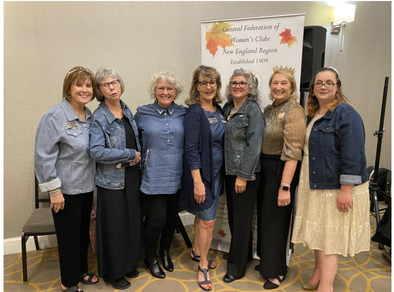
New England State Presidents and Director of Junior Clubs