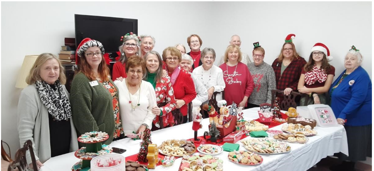
GFWC MA Board of Directors Holiday Party and Cookie Swap