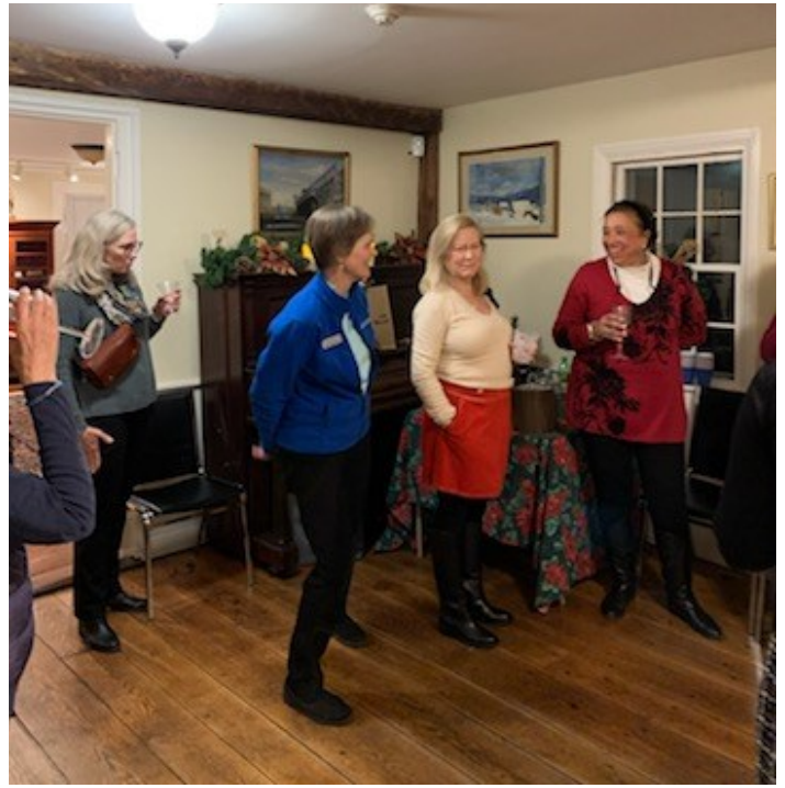
GFWC Needham Women's Club Holiday gathering at the Needham History Center and Museum on November 29.