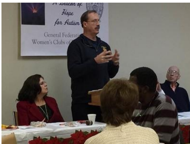
Sudbury Fire Department EMT discusses life saving defibrillator information with clubwomen