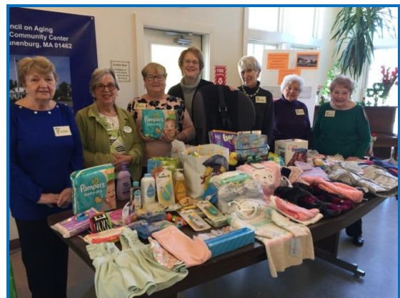
In March Lunenburg members held a baby shower for CareNet, a pregnancy resource center of North Central Massachusetts.