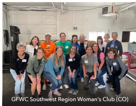
GFWC Southwest Region Woman's Club (CO)