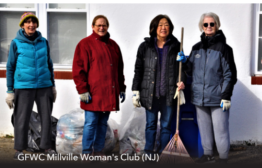
GFWC Millville Woman's Club (NJ)