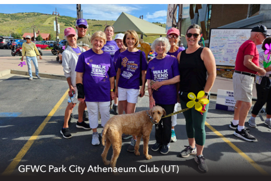
GFWC Park City Athenaeum Club (UT)

The last week of every April serves at GFWC Volunteers In Action Week nationwide. GFWC not only commemorates GFWC Federation Day on April 24, but the week is used to celebrate the projects performed by clubs with the GFWC Special Programs, Community Service Programs, and Advancement Plans. Projects fall in the areas of: