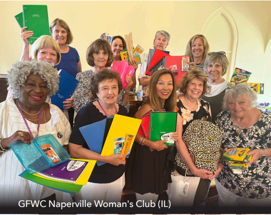
GFWC Naperville Woman's Club (IL)