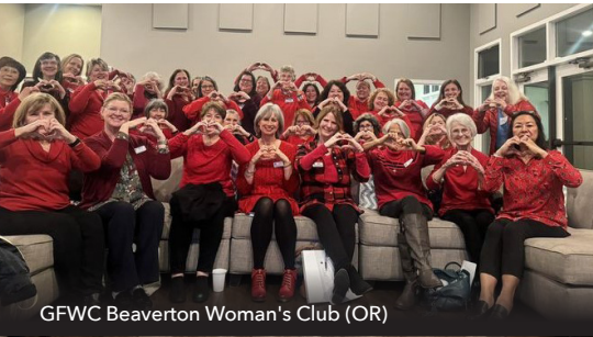
GFWC Beaverton Woman's Club (OR)