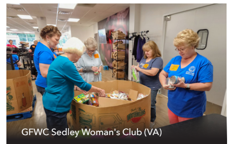
GFWC Sedley Woman's Club (VA)