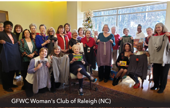
GFWC Woman's Club of Raleigh (NC)