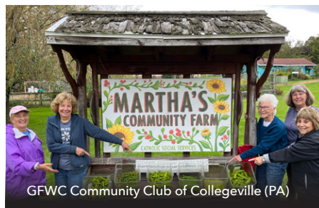
GFWC Community Club of Collegeville (PA)

Please be sure to spotlight your club's activities, by tagging GFWC on social media @GFWC and by adding #GFWCVIA. As always, thank you for Living the Volunteer Spirit!