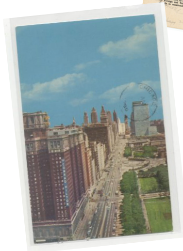
ABOVE The Call to Convention for the 1946 GFWC Annual Convention, which took place at what is now called the Hilton Chicago.