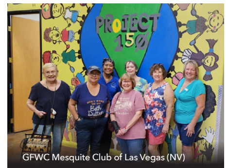
GFWC Mesquite Club of Las Vegas (NV)