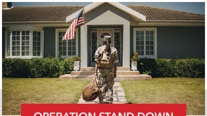
OPERATION STAND DOWN

GFWC Viera Woman's Club (FL) wanted to help the homeless so the club reached out to Streetside Showers, an organization that provides shower trailers, to place one in the area. Before this project, the homeless were bathing in the canal. Club members also collected socks, t-shirts, toiletries, and personal hygiene products. A collection box has been set up for continued support of this project.